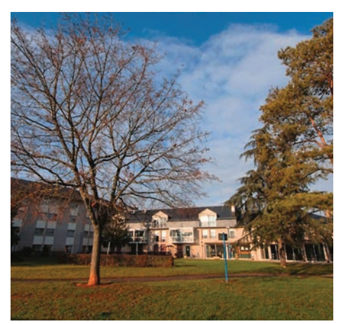
Résidence Habitat Jeunes Les Capucines 2 -Rodez Onet-Le-Chateau

CONTACT +33 (0)5 65 77 14 40 www.rodezagglo-habitat.fr