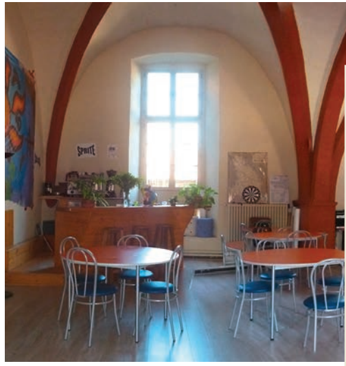
Résidence du Fort - Montauban URHAJ