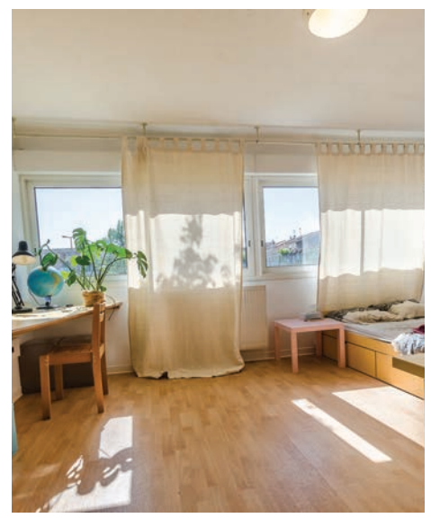
Résidence Crous L'Astrolabe