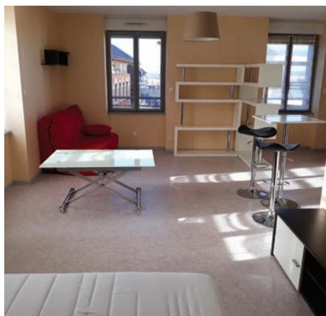
Résidence Habitat Jeunes Les Capucines 2 - Rodez Onet-Le-Chateau

Contact form : www.rodezagglo-habitat.fr