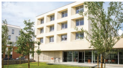
Résidence St-Exupéry - URHAJ

Close to Rangueil campus, University of Toulouse, ISAE-SUPAERO, ENAC and INSA