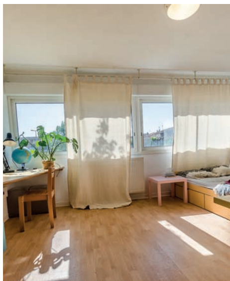
Résidence Crous L'Astrolabe