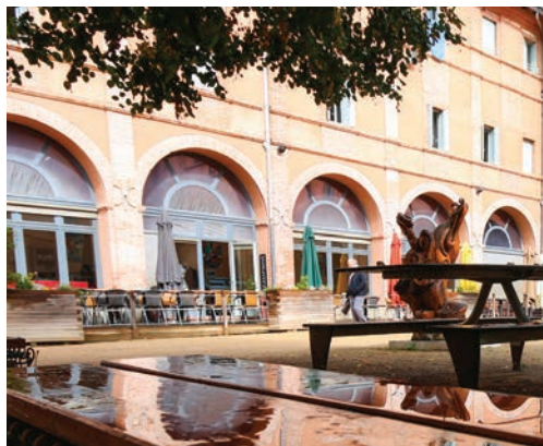
Résidence du Fort