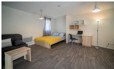
Résidence Les Triades - Promologis