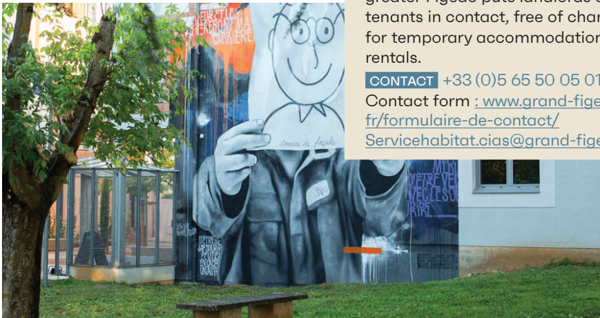
Résidence Habitat Jeunes Les Soleihos 2